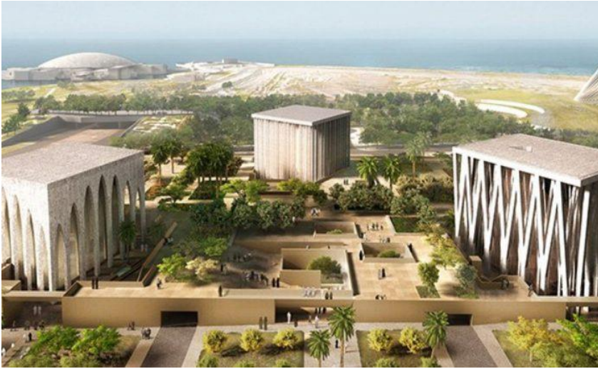
The Abrahamic Family House, UAE

The Abrahamic Family House welcomes people to connect, explore, and reflect. We serve to deepen understanding of our common humanity through mutual dialogue, exchange of knowledge, and the practice of faith.